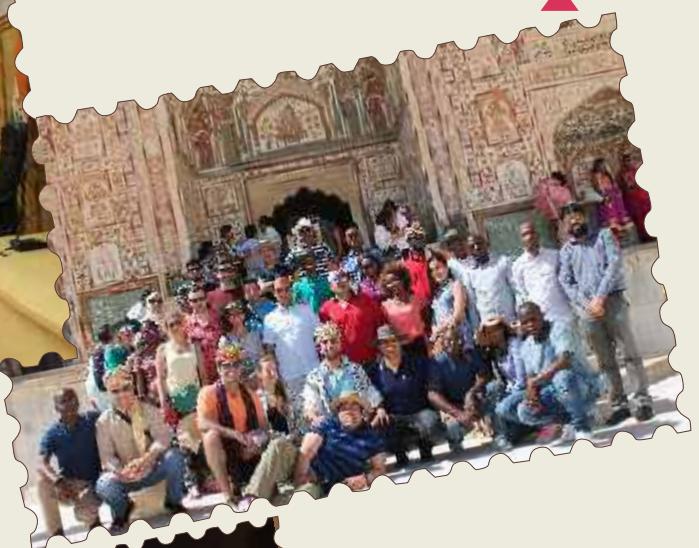
Visit to Jaipur by the participants of 65th Professional Course for Foreign Diplomats (PCFD) on 29 March 2018