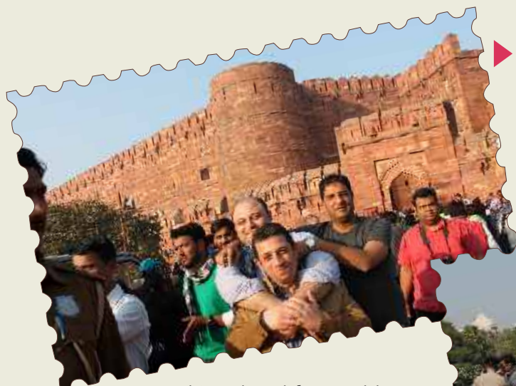
▶ Iraqi & Syrian Diplomats visit Agra Fort on 20 January 2018