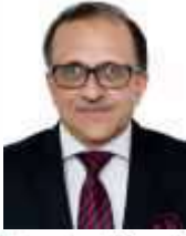
From the Dean's desk