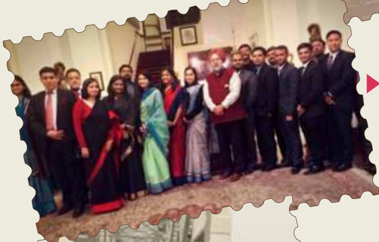
▶ Indian Foreign Service Officer Trainees of 2017 batch visit Kathmandu on a neighboring Mission attachment to Nepal in January, 2018