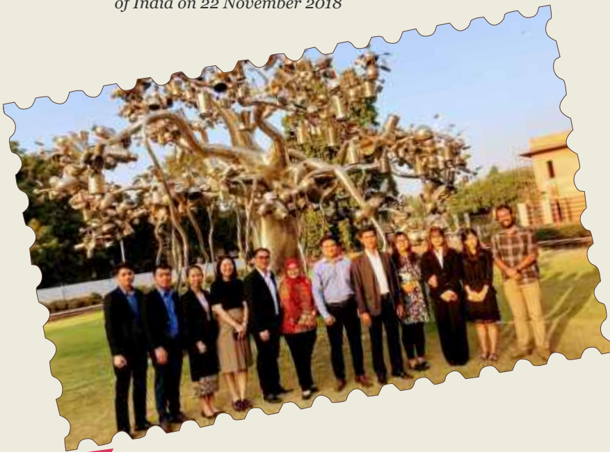
12th Association of Southeast Asian Nations (ASEAN) course participants visit the National Gallery of Modern Art, New Delhi on 23 November 2018