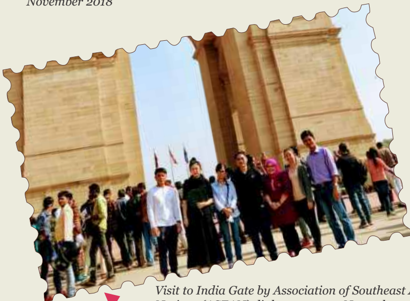
Visit to India Gate by Association of Southeast Asian Nations (ASEAN) diplomats on 25 November 2018