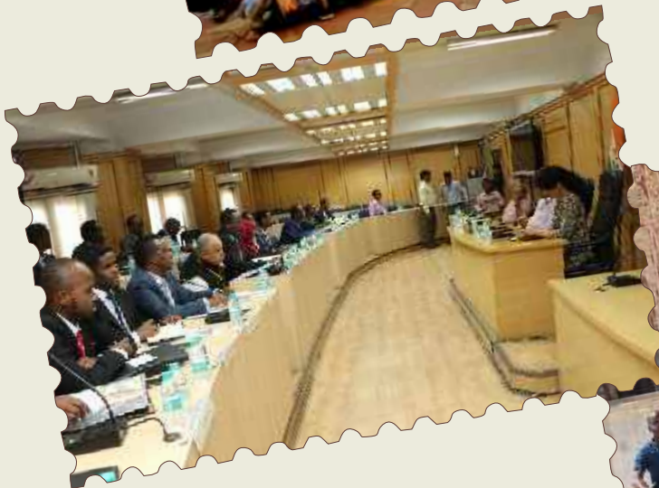
Visit to Election Commission by Somali diplomats on 16 May 2018