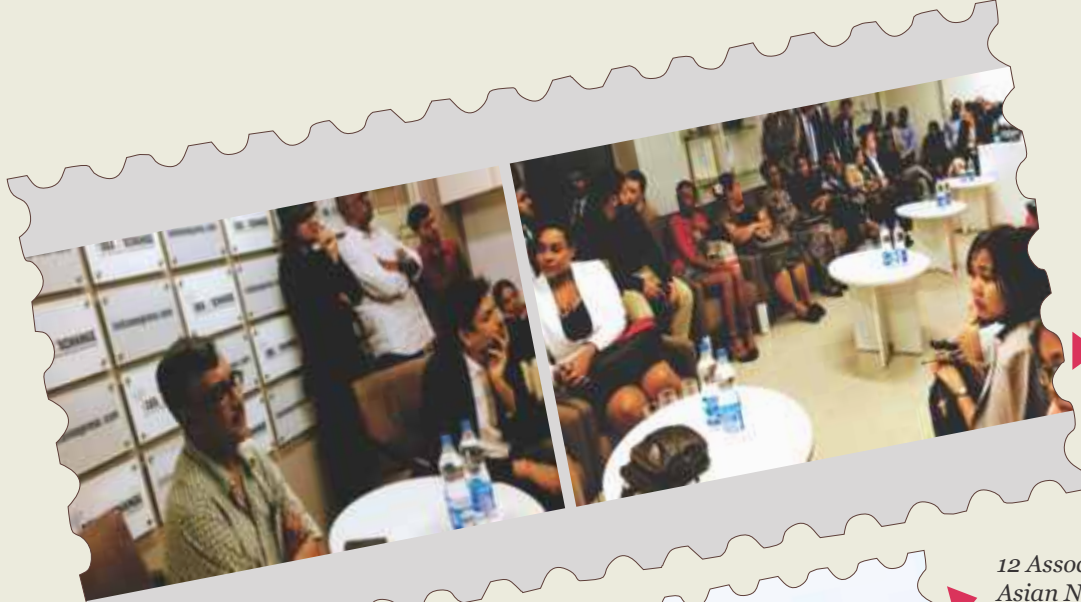
Participants of the 66th Professional Course for Foreign Diplomats (PCFD) visit the Indian Express Office on 24 September 2018