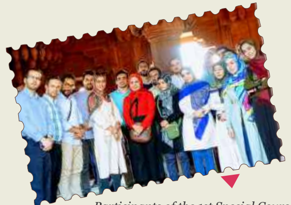
Participants of the 1st Special Course for Tunisian diplomats visit Rashtrapati Bhawan on 2 November 2018