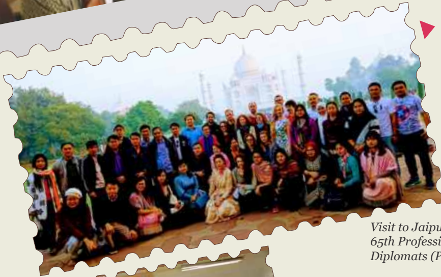
12 Association of Southeast Asian Nations (ASEAN), 4th Asia-Europe Meeting (ASEM) and 1st Special Course for Myanmar diplomats visit the Taj Mahal, Agra on 18 November 2018