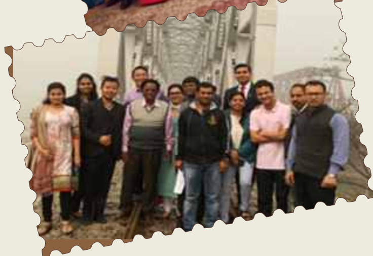
▶ Indian Foreign Service Officer Trainees of 2017 batch visit Bhairab Bridge in Bangladesh on 5 February 2018