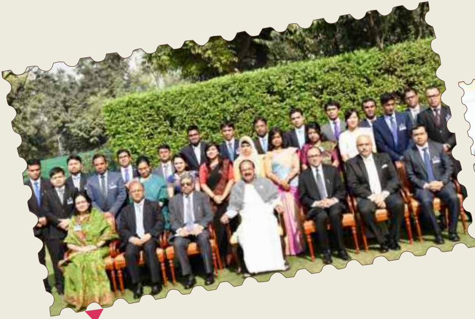
Bangladeshi trainee diplomats call on the Hon'ble Vice President of India on 22 November 2018