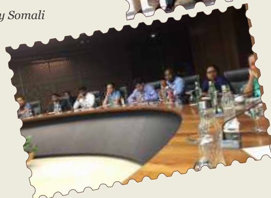
Participants of the 66th Professional Course for Foreign Diplomats (PCFD) visit the office of Infosys Limited on 1 October 2018