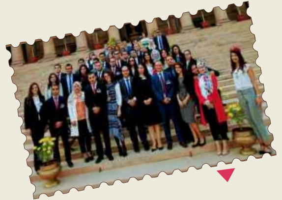
Visit to Fatepur Sikri by Iranian diplomats on 2 December 2018