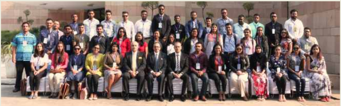
Participants of Know India Programme, 2018