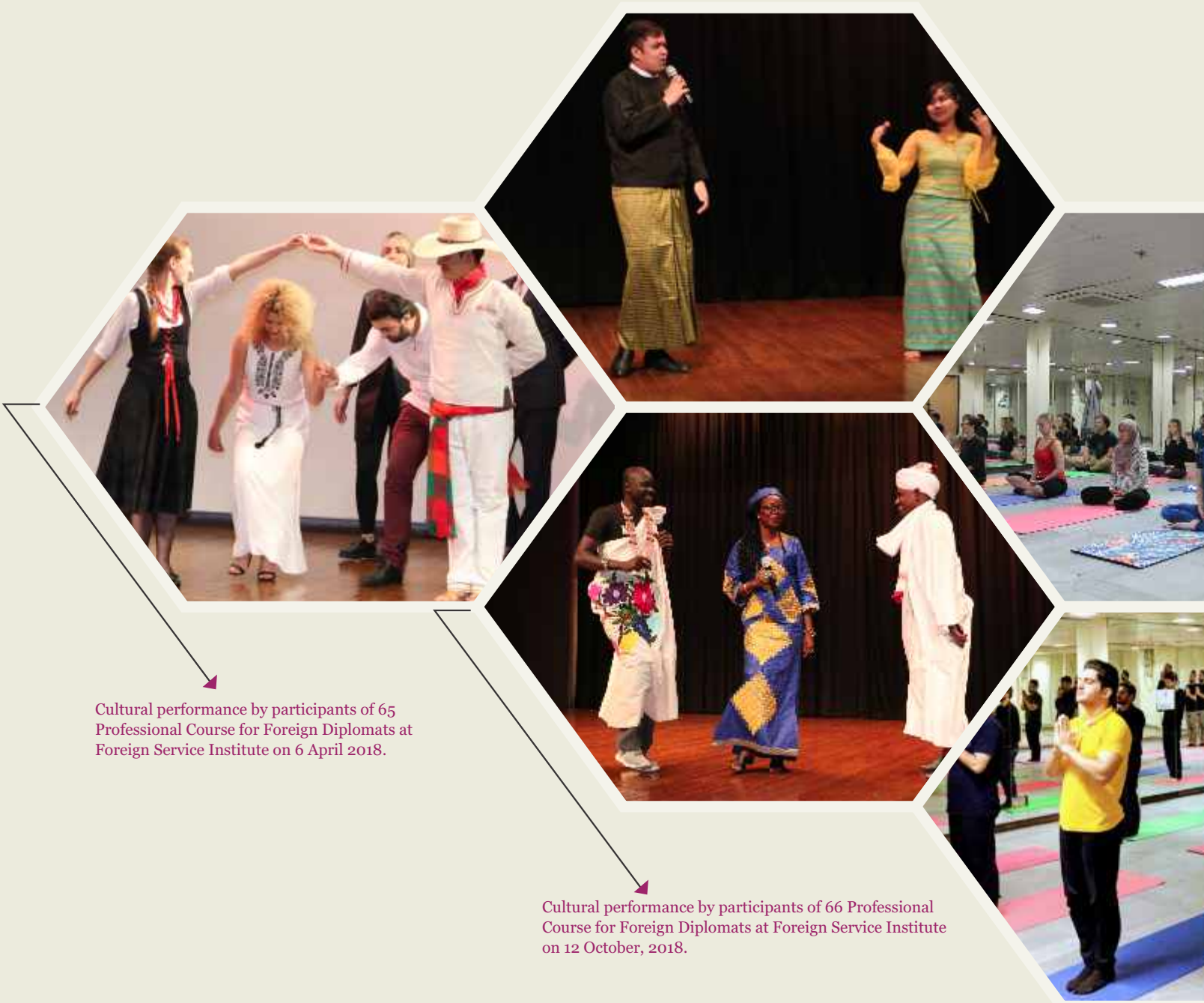
Cultural performance by participants of 65 Professional Course for Foreign Diplomats at Foreign Service Institute on 6 April 2018.