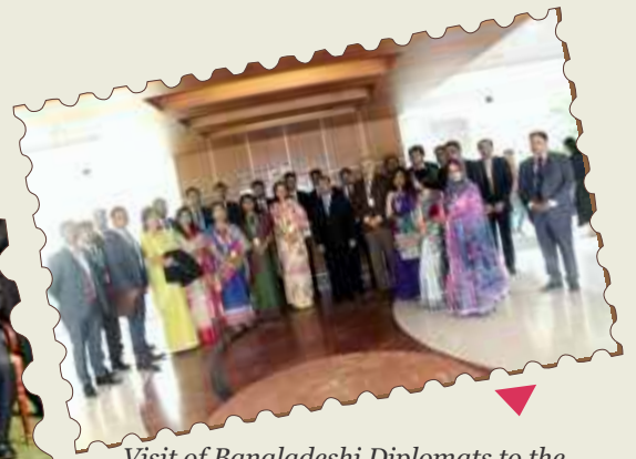
Visit of Bangladeshi Diplomats to the office of Tech Mahindra, Hyderabad on 26 November 2018