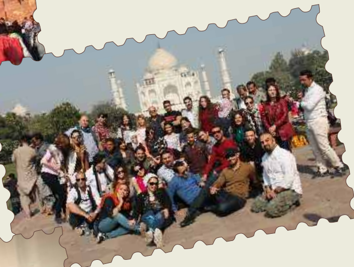
◀ Iraqi & Syrian Diplomats visit Taj Mahal on 20 January 2018